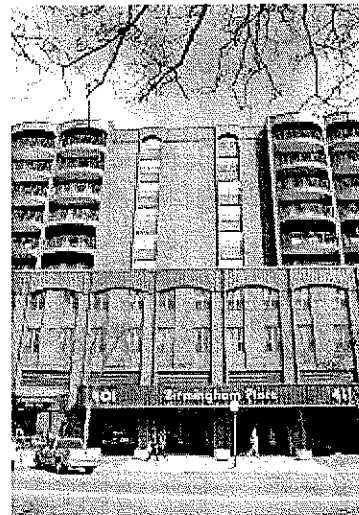
Renovations are planned at the Birmingham Place building to convert the building's apartments to upscale condominiums

Current Birmingham Place residents are being offered the first option to purchase their apartments.